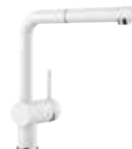
MATCHING TAPS Linus-S White