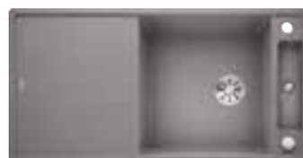
SINK Axia III XL 6 S Tartufo

Silgranit sinks, bowls and matching taps perform beautifully for a hard-working, stunning creative hub at the heart of your home.