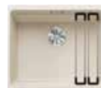
BOWL Etagon 500-U Soft White