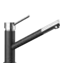
Kano Chrome/Rock Grey