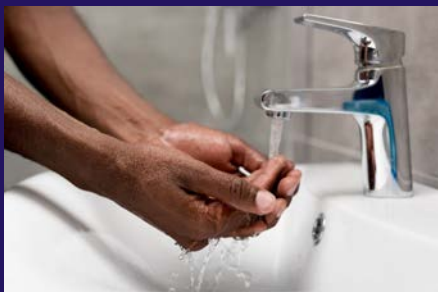
Washing hands frequently when carrying out work

Objective: To help everyone keep good hygiene through the working day.